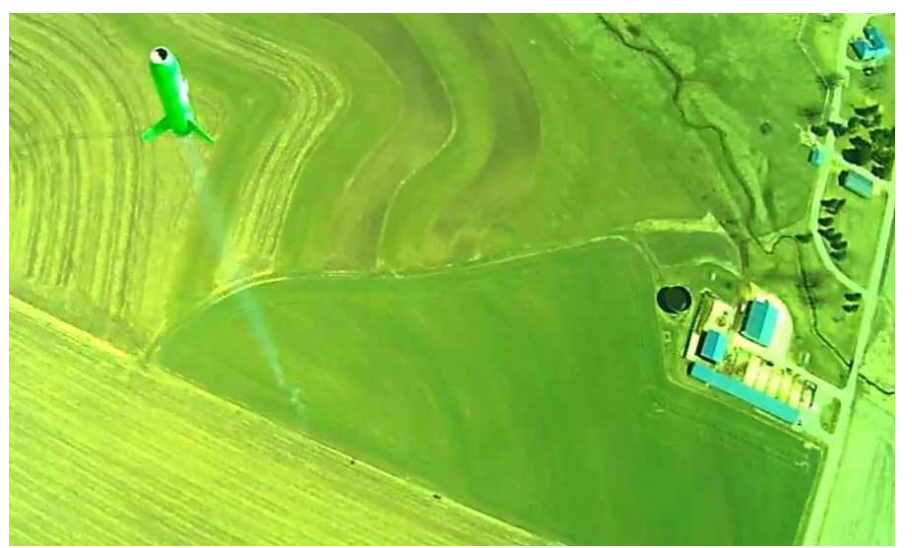
Figure 2: Image taken from the Dazed and Confused, dart section video camera during ascent-

Conclusion: Pioneer Rocketry has been blessed with a lot of success this past year. Moving forward, we have worked with the University of Wisconsin-Platteville to obtain a launch location near campus. We have worked hard to fully utilize these opportunities, and we are grateful for all the guidance, assistance, and funding provided by the Wisconsin Space Grant Consortium and Tripoli Rocketry.