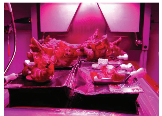
Fig. 2: VEGGIE root mat modules growing cabbage