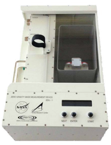
Fig. 3: Top View of the Zero Gravity Mass Measurement Device (ZGMMD)

By utilizing Newton's second law, it can be seen that mass could be derived if you knew that an object was being accelerated, and you were able to quantify both the acceleration and the forces acting upon it. The resulting equation (upon rearranging the previously shown equation) would be: m = F/a.