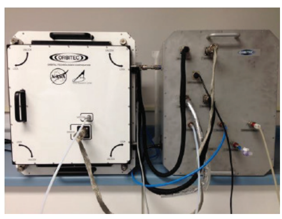
Fig. 4: Front view of the plastic waste melt compactor (left) and support equipment (right)

During my tenure, I worked extensively on testing and troubleshooting the system to improve water recovery and system efficiency. A persistent issue early on was the variable water output from test to test. To study this issue, I examined the effects of