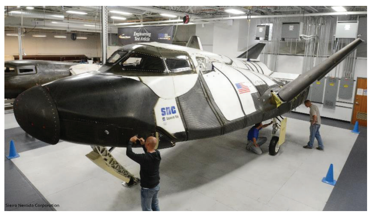
Fig. 5: Assembly of Sierra Nevada Corporation's Dream Chaser Spacecraft

ORBITEC is responsible for the environmental/thermal control and reaction control systems. This includes but is not limited to thermal and oxygen regulation onboard the spacecraft as well as the reaction control thrusters that would direct the spacecraft on orbit.