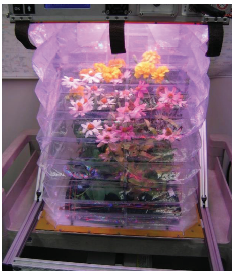
Fig. 1: Flowers growing inside a VEGGIE unit

The Vegetable Production System (VEGGIE) is used to produce vegetable (salad) crops to supplement prepackaged foods during long stays in space. The innovation of the VEGGIE is in providing, within a single middeck locker, a plant growing facility with a growing area of 0.25m2 to 0.5m2, a light source sufficiently intense for crop production, a compressible nutrient and water delivery system, and a semi-passive atmospheric control system that minimizes water use without limiting gas exchange (ORBITEC, 2012). The system is deployed using an expandable enclosure, as shown in (Fig. 1).